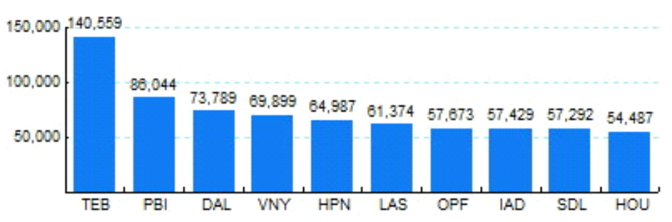
6.Top Ten Airports for Domestic Business Jet Operations Nov 21 - Oct 22