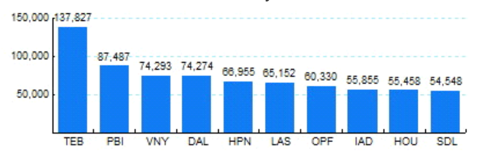
6.Top Ten Airports for Domestic Business Jet Operations Jun 21 - May 22