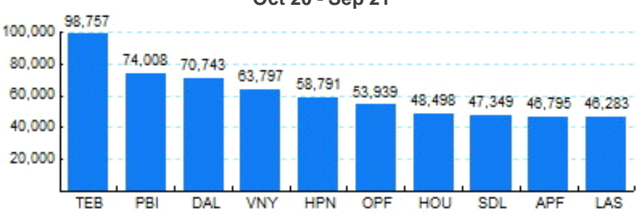
6.Top Ten Airports for Domestic Business Jet Operations Oct 20 - Sep 21